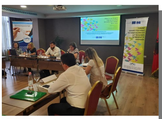
15 July 2021