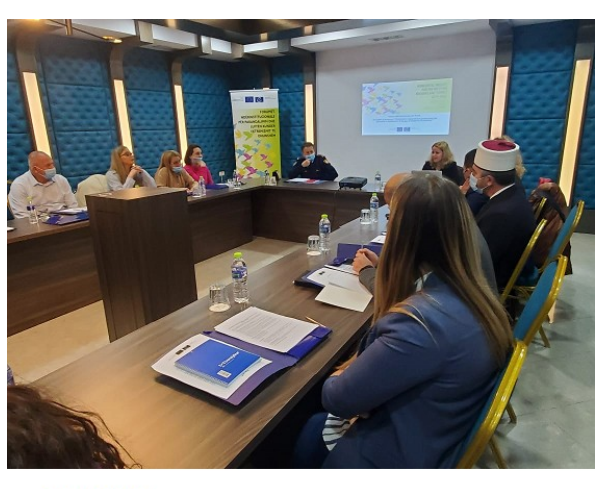
07 October 2021